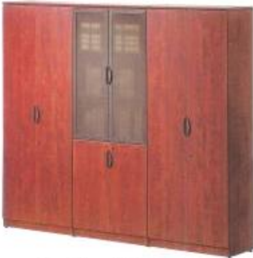
High Cabinet with Wooden Doors x 3

Dark cherry or Honey Maple (As in pictures) 3 Days lead time # cupboards in picture