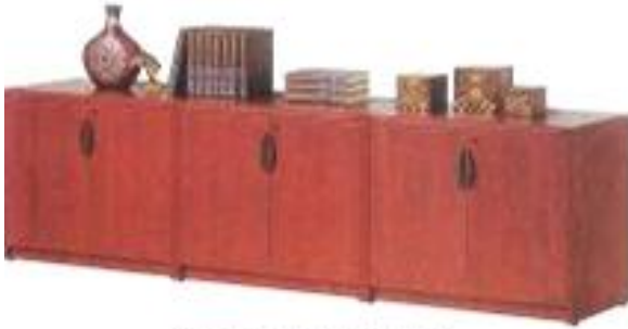
Double Door Cabinet x 3